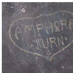
ARCHIVE EXAMPLE 010