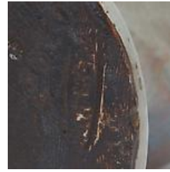
SPINAL VINE AM099