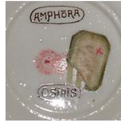
ARCHIVE EXAMPLE 003