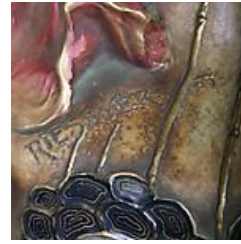
ARCHIVE EXAMPLE 015