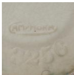
CORAL FLASH AM101