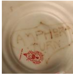
ARCHIVE EXAMPLE 002