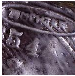
WAX DRIP CANDLESTICK C0008