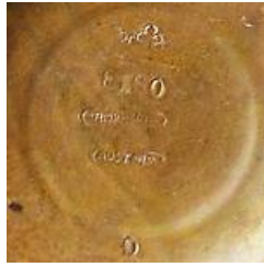
MONSTER OWL VASE AM113