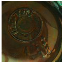
ARCHIVE EXAMPLE 004