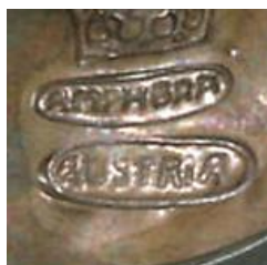
GILDED CHALICE C0004