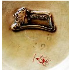
SEVEN MAIDENS VASE STE024