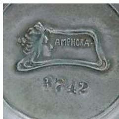
ARCHIVE EXAMPLE 007