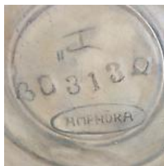
ARCHIVE EXAMPLE 008