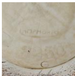
CORAL BLITZ AM100