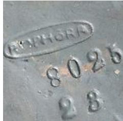
SYMBOLIST MASK AM110