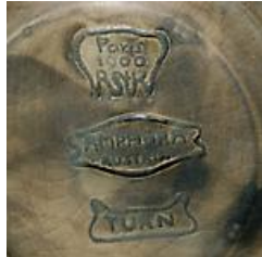
ARCHIVE EXAMPLE 016