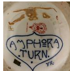
ARCHIVE EXAMPLE 006