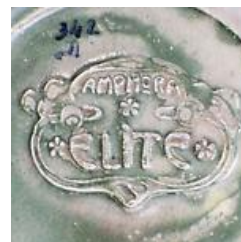
ARCHIVE EXAMPLE 012