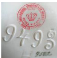
ARCHIVE EXAMPLE 011