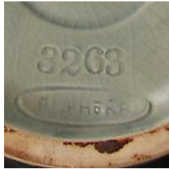
ARCHIVE EXAMPLE 001