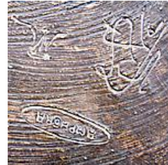
ARCHIVE EXAMPLE 018