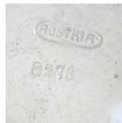
ARCHIVE EXAMPLE 009