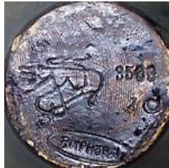
ARCHIVE EXAMPLE 020