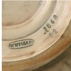
ARCHIVE EXAMPLE 017