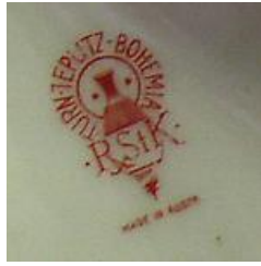
ARCHIVE EXAMPLE 014