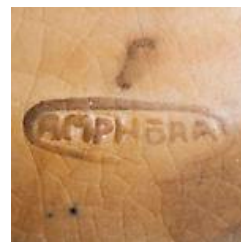
EASTERN DRAGON VASE AM112