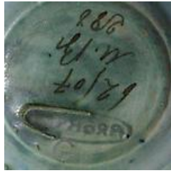
ARCHIVE EXAMPLE 013