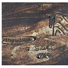
LEAFY BOUQUET C0005