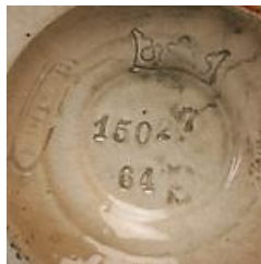
ARCHIVE EXAMPLE 005