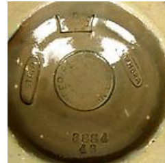
ARCHIVE EXAMPLE 021