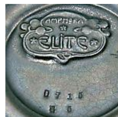
LOLLIPOP CREEPER AM098