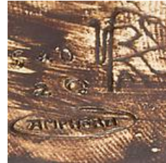
TWISTED LILY PADS C0007